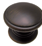
K 124 BORB