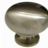
K 101 BN