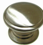
K 124 BN