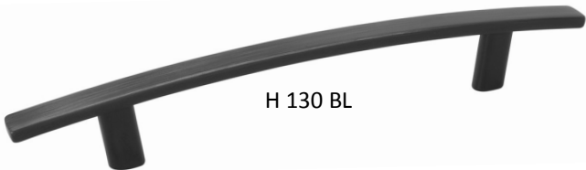
H 130 BL