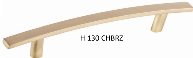
H 130 CHBRZ