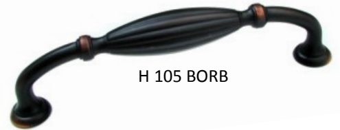
H 105 BORB