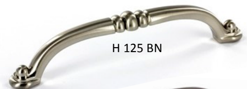
H 125 BN