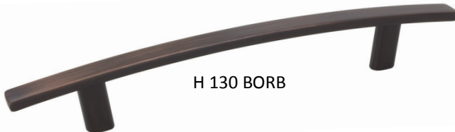
H 130 BORB