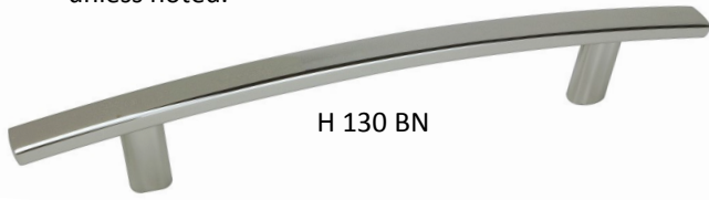
H 130 BN