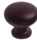
K 101 BORB