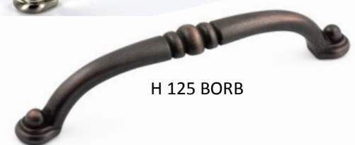
H 125 BORB