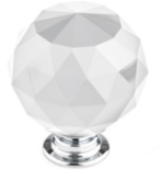
K 132 CR