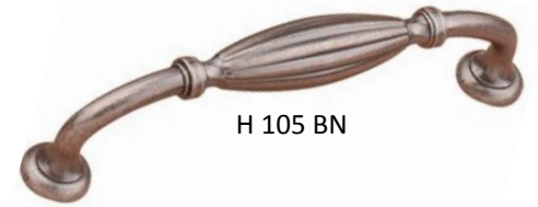
H 105 BN