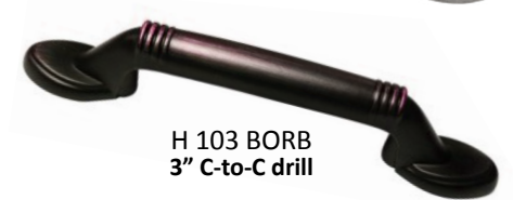
H 103 BORB 3" C-to-C drill