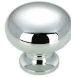
K 101 C