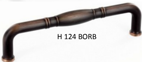
H 124 BORB