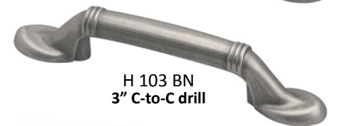
H 103 BN 3" C-to-C drill