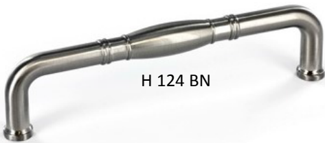
H 124 BN