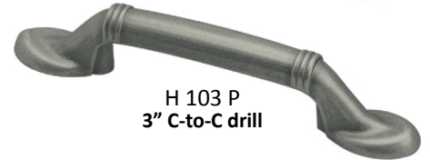
H 103 P 3" C-to-C drill